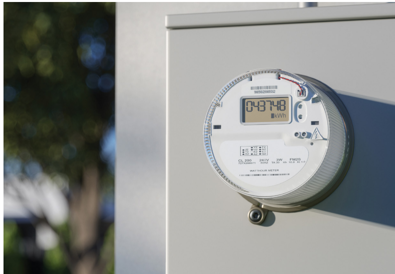
Central Hudson has successfully transitioned customers in all five of its operating districts to monthly meter reading, more than one month ahead of schedule. Monthly meter readings provide confidence that customers’ bills align closely with actual usage on a monthly basis and give customers a better understanding of energy usage and consumption patterns.